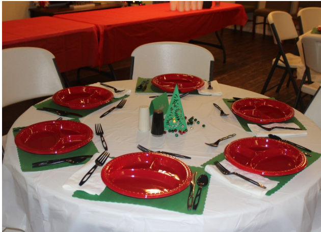
Table setting Friday night

The evening dinner as prepared by our caterer Ronda consisted of Spaghetti & Meat Balls, Garlic Rolls, Tossed Salad and some delicious desserts.