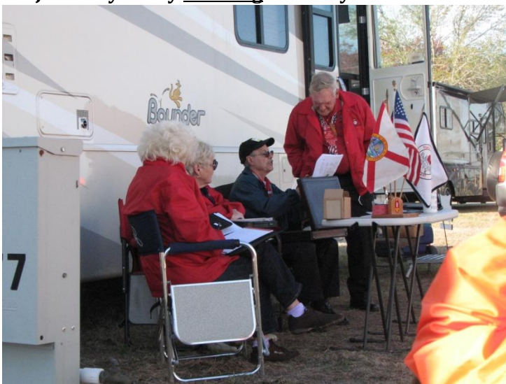
Getting ready for the Business Meeting