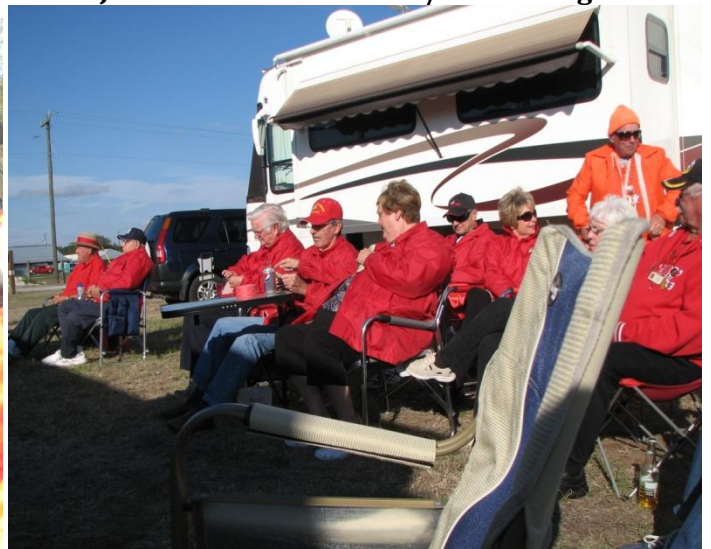
Let's get this meeting started!