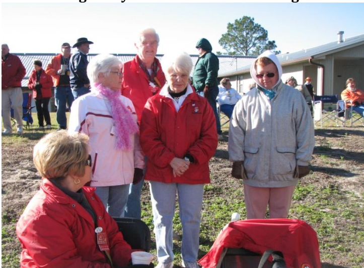
One of TBS' Bocci Ball Teams