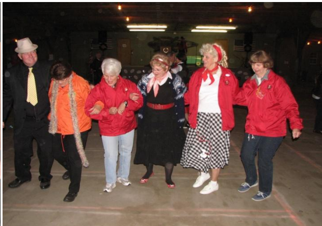
State Director & TBS Ladies

Well the Samboree was over and although it was cold, we only had one day of bad weather. The afternoons were sunny and warm and we all had a great time. Speaking of time, it seems to fly while we are at the Samboree. It's hard to believe the time has come to say our goodbyes to all our friends. Although TBS puts in many volunteer hours during the Samborees, I believe we all have a great time and wouldn't have it any other way.