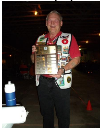
Our President with the plaque that was presented to TBS.

During the opening ceremony, certificates were presented to Sassy Sams, Rolling Sams, and Jax Rambling Sams for winning second place in the Chapter of the Year competition. Trail Blazing Sams received a certificate as well as a plaque for winning first place 2010 Chapter of the Year.