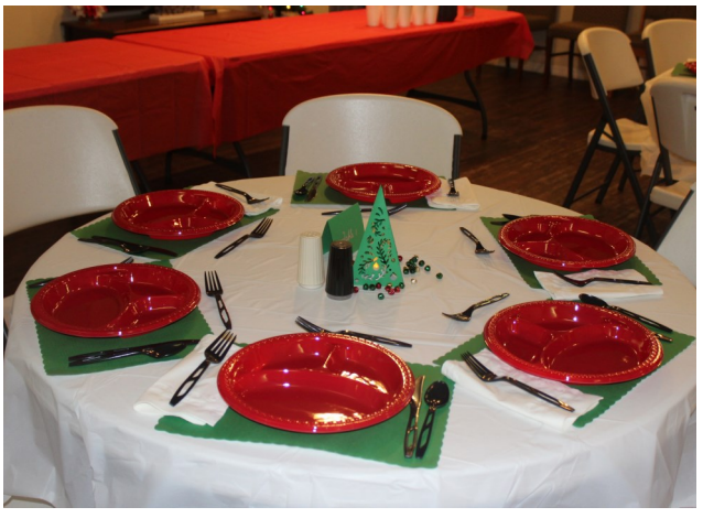
Table setting Friday night

Life is a combination of magic and pasta. (Frederico Fellini)