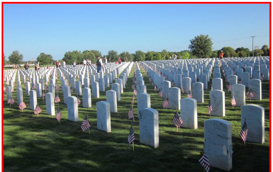
So beautiful with all the flags lined up.