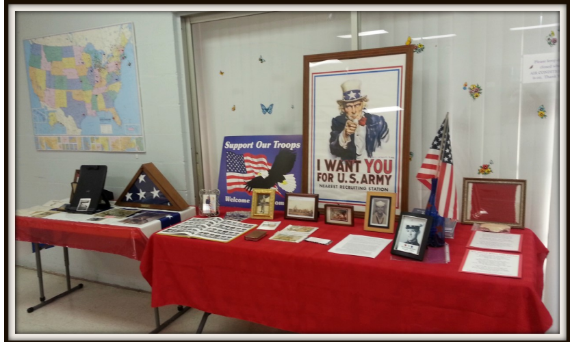
A table was set as a tribute to our TBS Veterans.