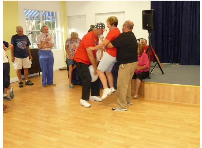
A little bit of cheating going on?