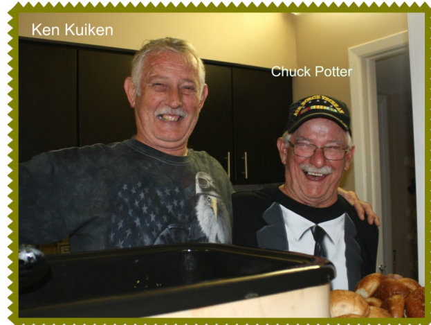
The servers at work.....

After dinner several different games were being played by various groups.