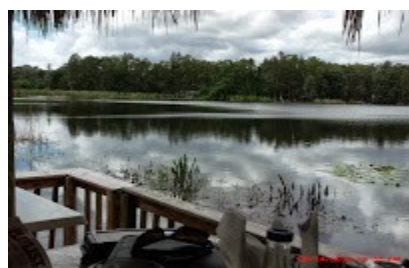
The view on the lake at Ukelele Brand's