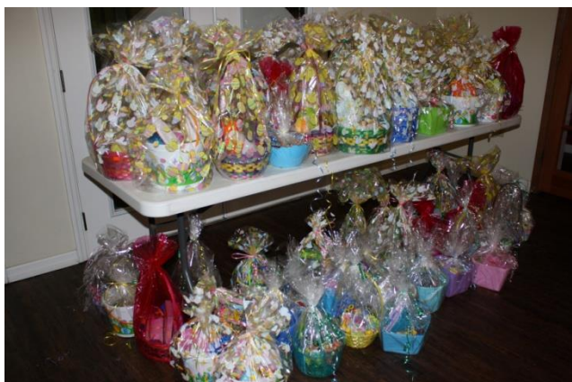
70 beautifully completed baskets