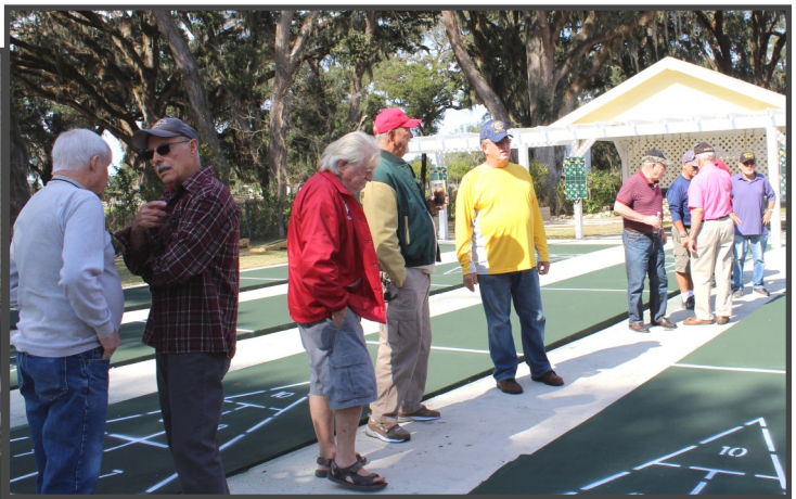
The Guys - Not So Much O