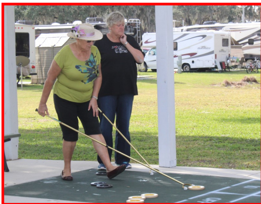
Trying for a perfect 10