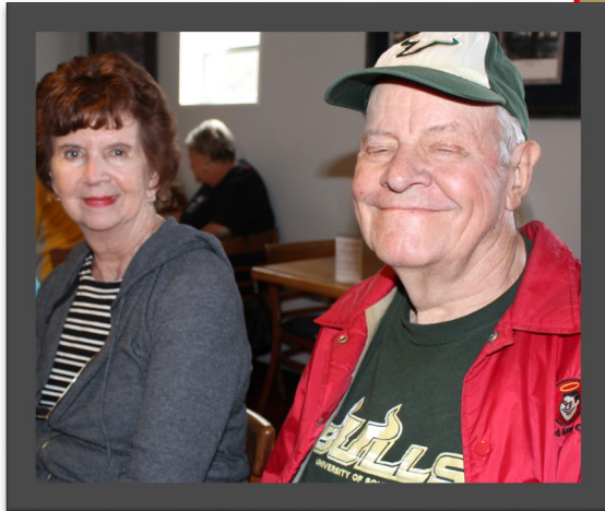
Waiting for dinner at GrantLee restaurant