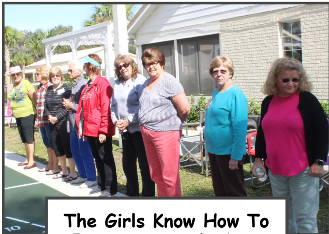
The Girls Know How To Form A Straight Line