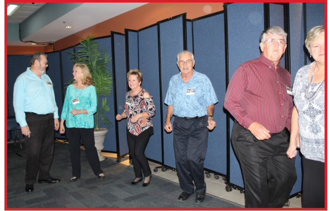
The TBS Version of Line Dancing

For almost 15 years, a group of TBS friends has celebrated New Year's Eve at Lazy Days. Three nights and four days of food, fun, good friends and entertainment.