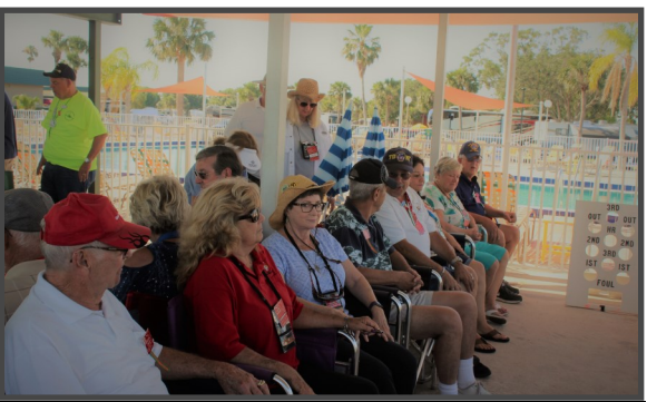
Playing Bean Bag Baseball

For the first time, one of the games at a Florida Rally was Corn Hole