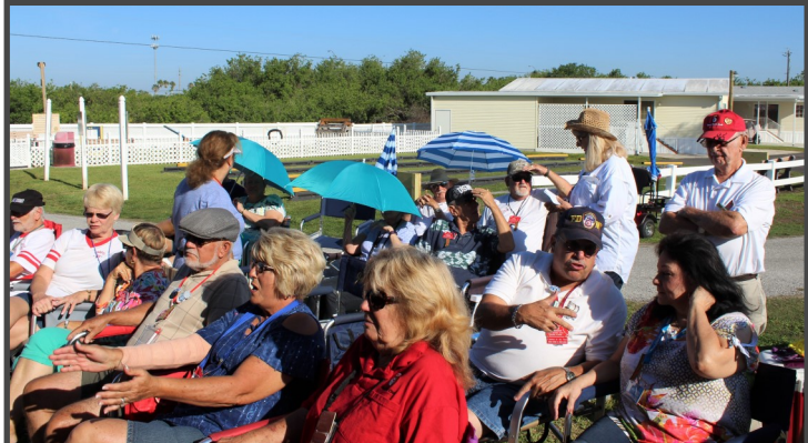
ABOVE: Trail Blazing Sams members waiting to play Bean Bag Baseball.