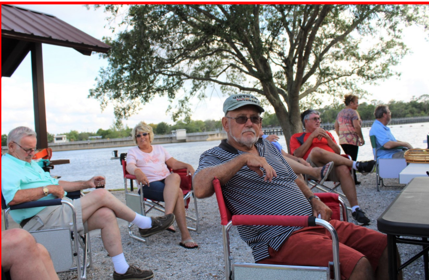
It Is So Relaxing To Just Sit By The River Enjoying The Time With Good Friends