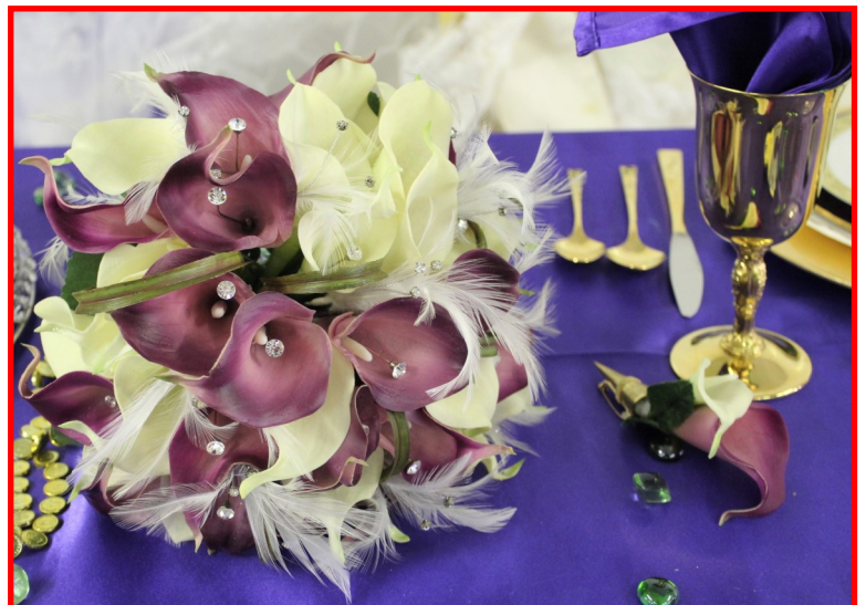
Color Coordinated Bouquet & Boutonniere