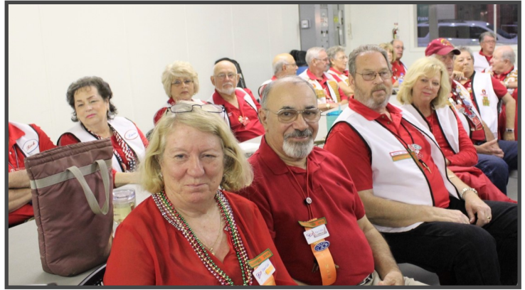
ABOVE: Trail Blazing Sams members are ready for the evening's entertainment.