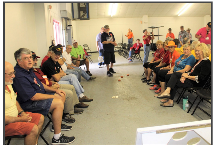
The Very Competitive TBS vs TBS Game