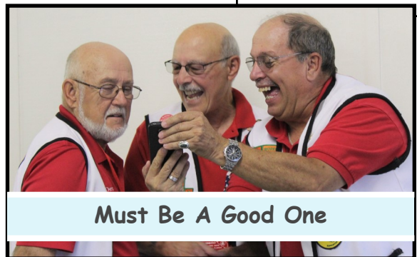
Must Be A Good One