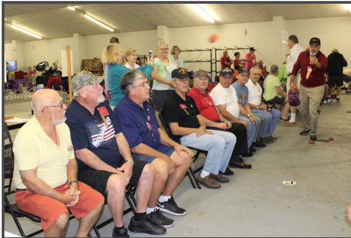
Another Home Run For The Guys