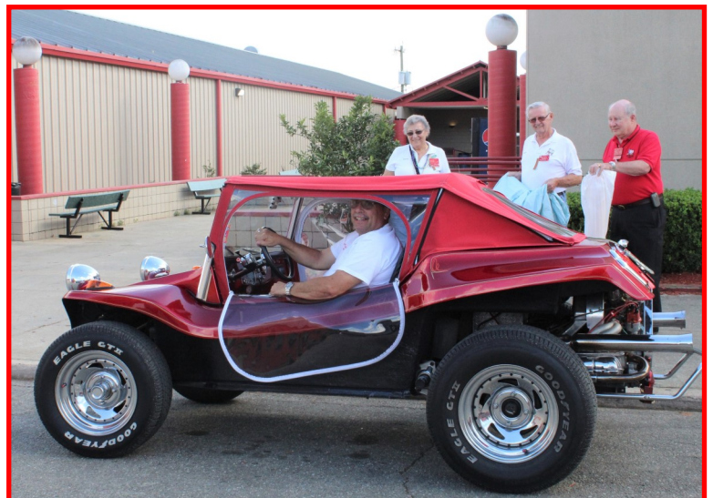
Frank's New Ride