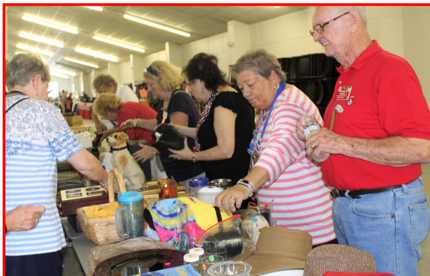
Lots of Good Stuff