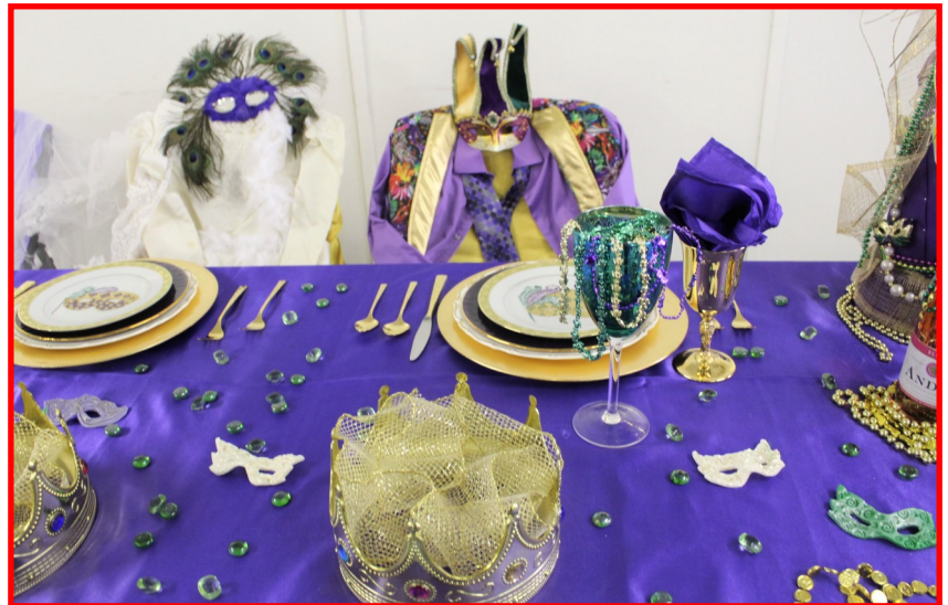
What A Beautiful Table