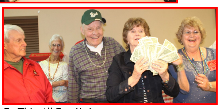
Is This All For Me?