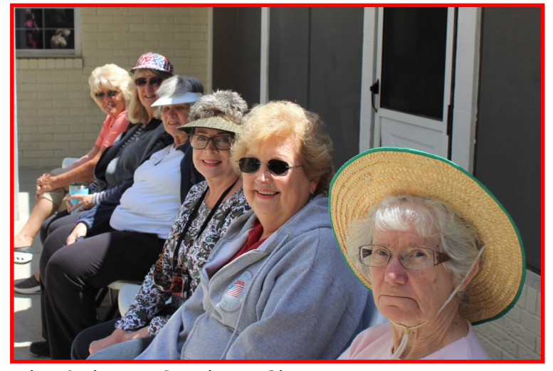
The Girls Are Ready To Play