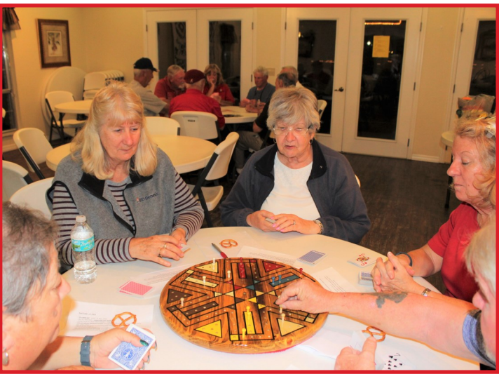
We Love To Play Games