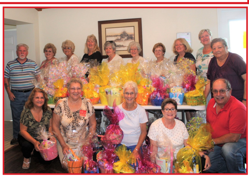
We Had So Much Fun Making The Easter Baskets

Our final tally was over 60 beautiful baskets.