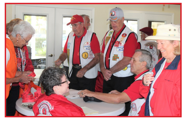
We All Want Raffle Tickets