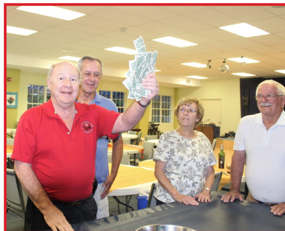
Guess Who Was The Big Winner