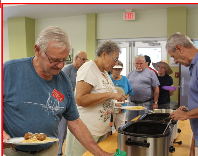
Everything Looks So Good