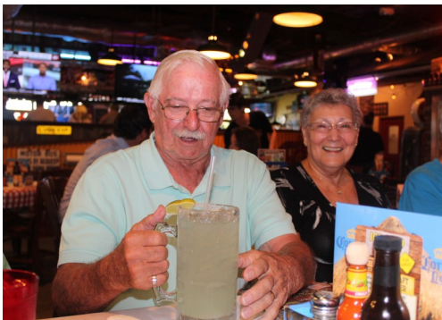
Now That's A Margarita