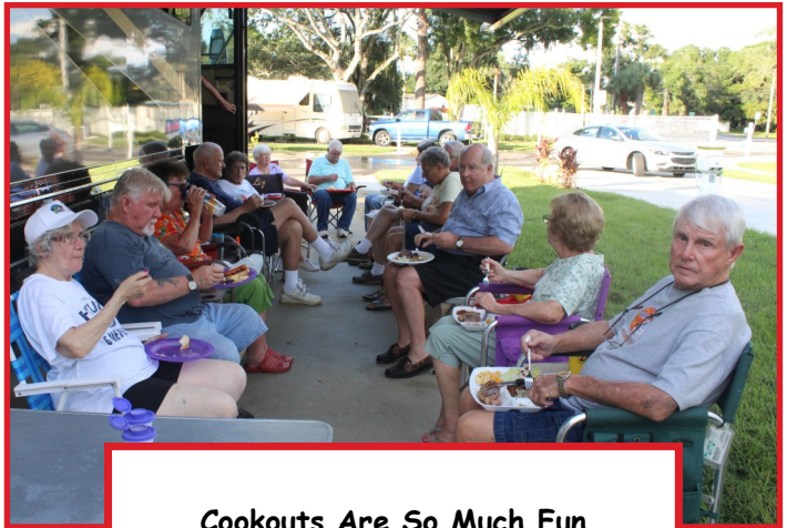
Cookouts Are So Much Fun