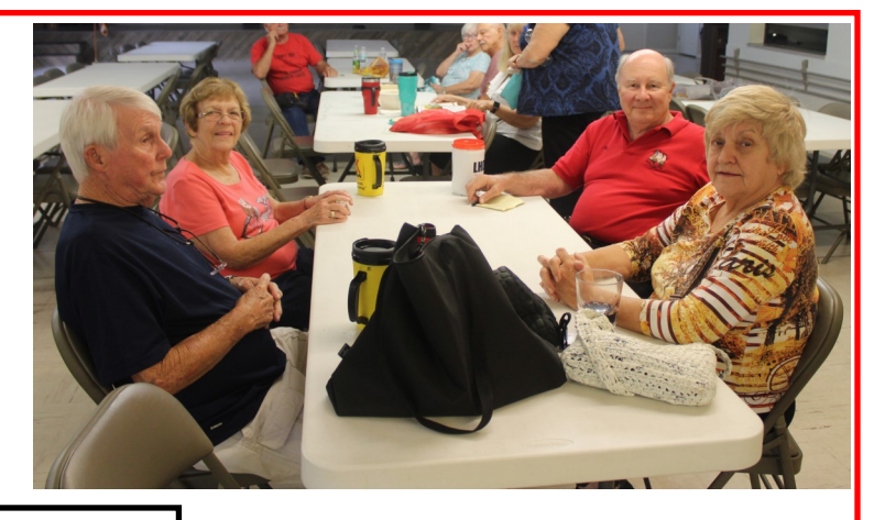
Waiting for dinner